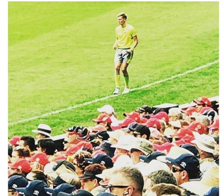
Corey in action during the AFL Round 1 clash between Adelaide v GWS at Adelaide Oval