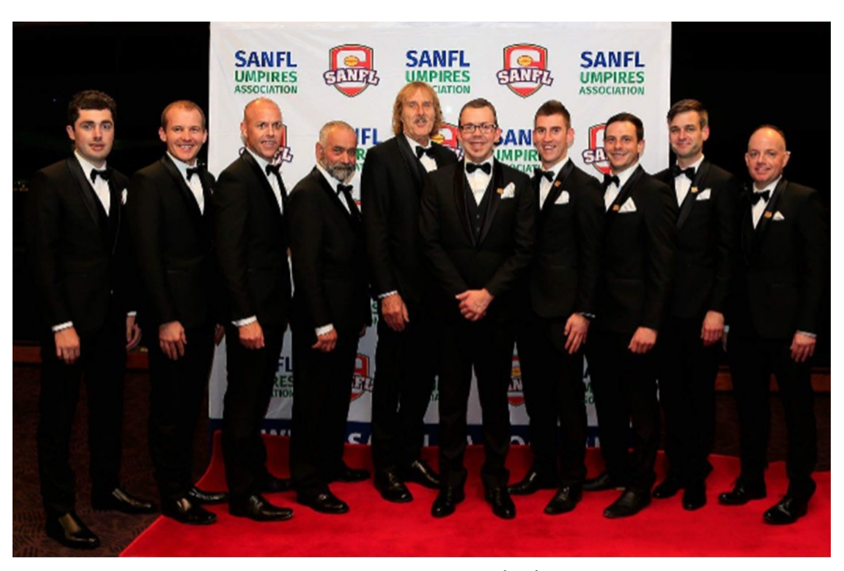
2017 SANFL Committee (L-R)