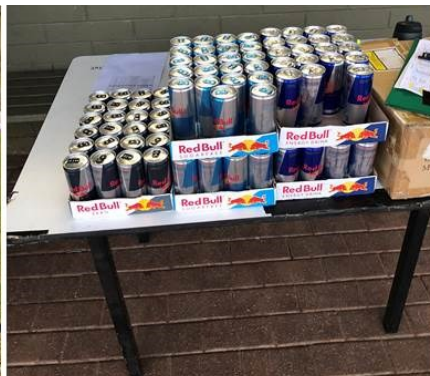
Red Bull providing cases of drinks to be shared amongst our members