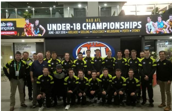
The full 2018 U18 Championship Representative Squad at AFL House