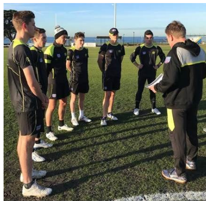
U18 Field Umpires receiving some coaching at Williamstown Oval