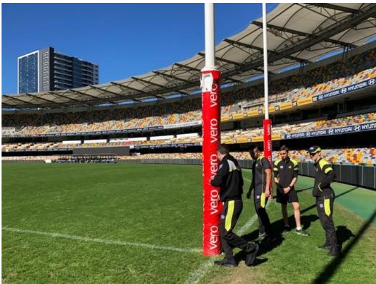
U16 Goal Umpires checking out our area with AFL Goal Umpire Shaun Apted