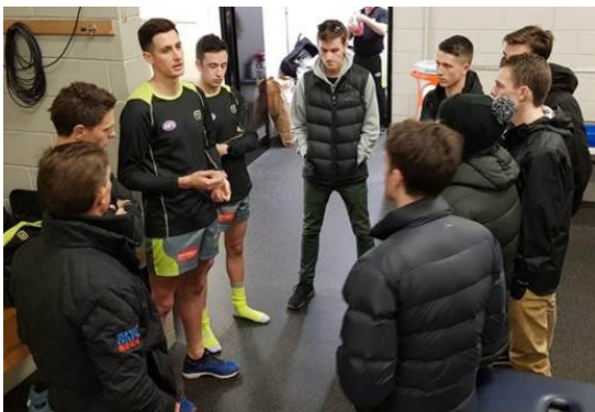
U18 Boundary Umpires hearing from the AFL Umpires at the MCG