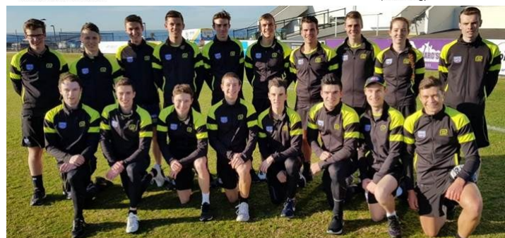
All 2018 U18 AFL Championship Umpires at Williamstown Oval