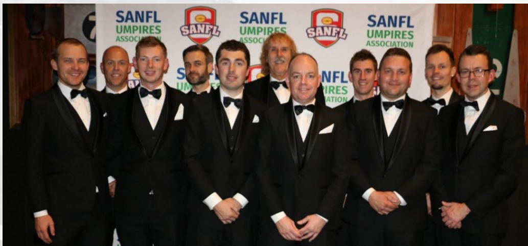
2019 SANFLUA Committee (L-R):

Thank you all for attending and continuing to support your Association.